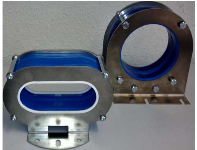
MS-284 and MS-116 examples